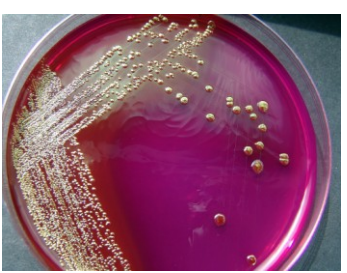
(E. coli bacteria in a Petri dish)

http://www.lightingdarkness.com EMAIL: tnkpilgrim@lightingdarkness.com