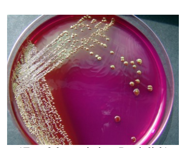
(E. coli bacteria in a Petri dish)

http://www.lightingdarkness.com EMAIL: tnkpilgrim@lightingdarkness.com